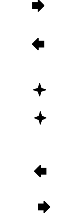
Fig. 1. Organization of Posner Task. If the plus sign was presented for the trial, then the detection stimuli occurred with equal probability to the left or right of the fixation point. For the cued trials, the detection stimuli occurred at the indicated location with probability of 0.8 and occurred at the opposite side with the probability of 0.2.

A preliminary examination of the data in Fig.2 shows that valid cue facilitates performance in all noise conditions while invalid cue does not facilitate performance. This observation is more prominent at higher noise intensities: in 115 dB intensity condition, invalid cueing degrades performance while accurate cueing improves performance.